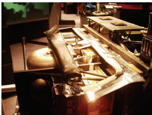
▲ This model shows the location and orientation of the Active Descent System tank and nozzle on the top surface of the Rosetta Lander

This autonomous propulsion system is designed to provide extreme performance and control within amazingly small envelope dimensions. The complete system has a total mass (including propellant) of 3.52 kg. Its envelope dimensions are limited to 236 x 340 x 105 mm for the complete system. With these very demanding mass and envelope requirements, the system –especially the tank- design required special care and has led to a complete new development for all parts and components. For example for the thruster valves and pressure transducers, part of the housings were integrated into the system structure. Electronics for all parts and components are integrated into a single e-box centralised within the ADS system.